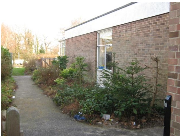
This border is the exact width of a double decker bus allowing for a small gap between wall and bus.