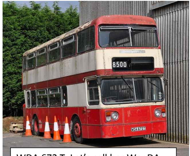
WDA 672 T. Let's call her WanDA