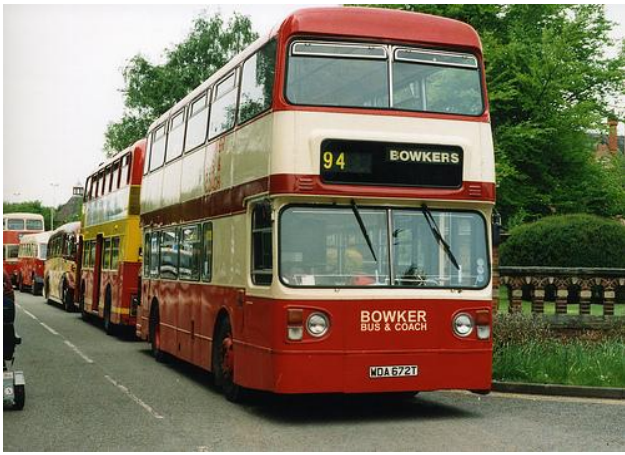
This is how she looked in 2009

Do we have a space of 2.5 metres in width that's long enough for a bus?