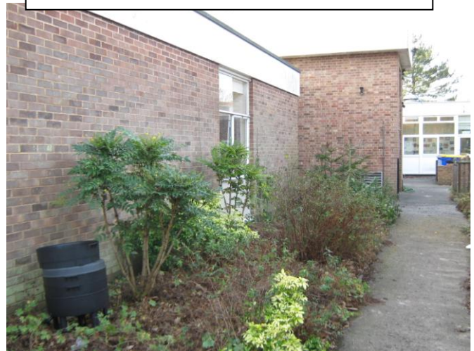
It's currently unused space, but could be transformed into a street scene.