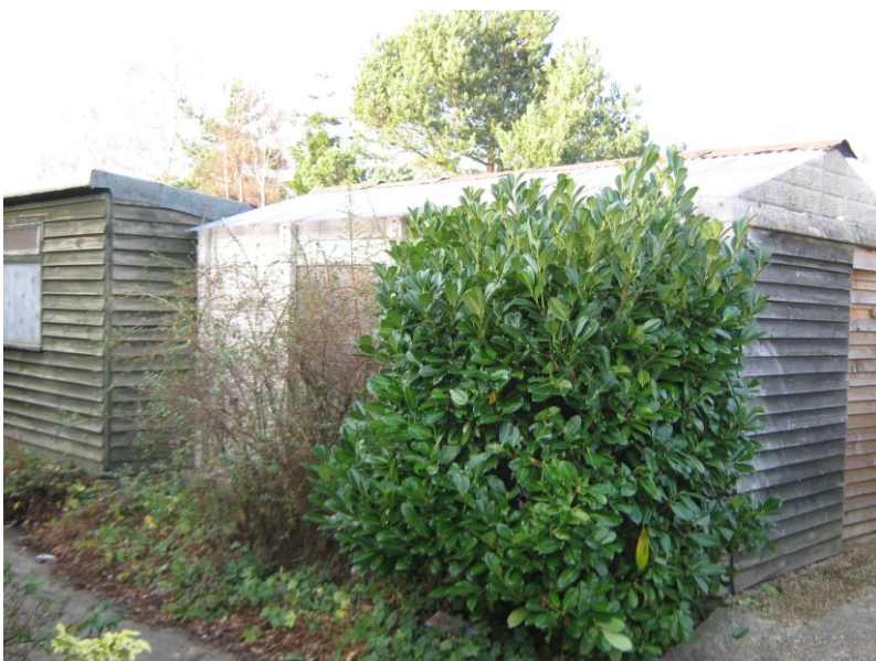
The changing room and garage could have a street scene painted on them and the bush replaced by a bus shelter

She's a Daimler Atlantean Fleetline – this is a rare model and has particular value to bus enthusiast, so will not lose value and, indeed, is likely to appreciate over time.