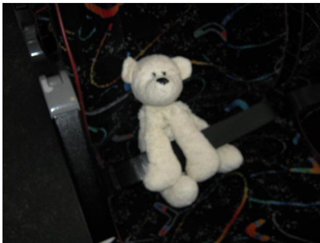
A mysterious stowaway was discovered surreptitiously snoozing on the coach