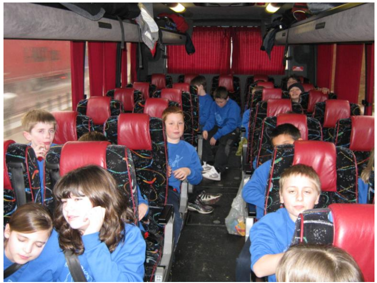
Happy little travellers

We're here! Hurrah! The journey was slower down south with the spray keeping everyone driving at a reasonable speed, but the further north we came, the clearer the conditions were. We didn't exactly arrive in sunshine, but it was clear and dry. In contrast to Kent, there's little sign of flooding up here.