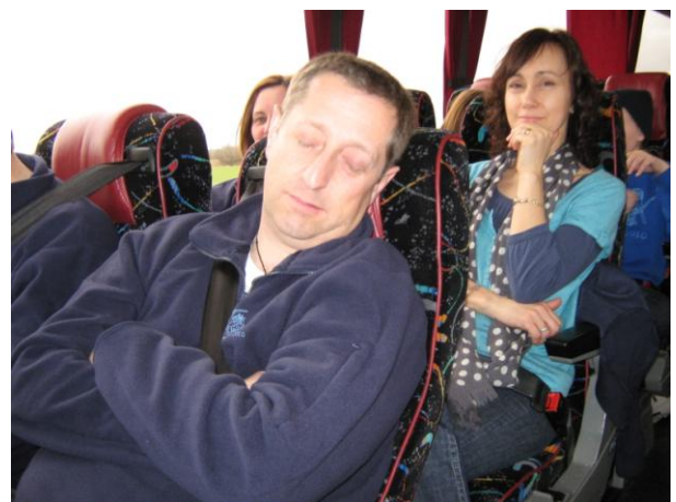
Others slept more brazenly!

Our only real excitement was being in the front of a rolling block on the motorway – if we appear on footage on Road Wars we'll be very happy, although we think it may have simply been the occupants of the traffic patrol car having a laugh before their lunch.